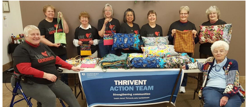
OPERATION SANTA NOVEMBER WORKDAY 2015

We hope everyone has a wonderful Christmas and a Happy New Year! The Outreach Committee